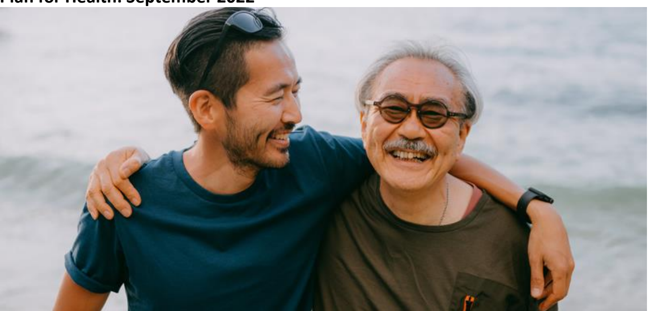
This month's highlights include Healthy Tips to Lower Your Risk of Diabetes and the Diabetes Prevention Program